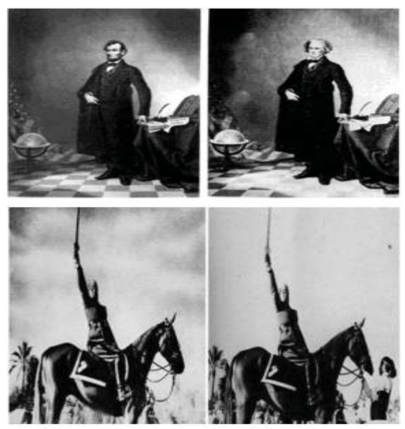
Fig.1 Illustration of typical image forgery

The Image Forgery is a kind of tricky and complex. The detection mechanism needs to be strong enough to comprehend the different types of the Image Forgery. Hence this requires the help of Artificial Intelligence approach. The machine learning mechanisms are high end and robust techniques that can deal with large sets of data to classify them and also are more accurate and precise than the manual methods. This is beneficial in the domain of Image Forensics.